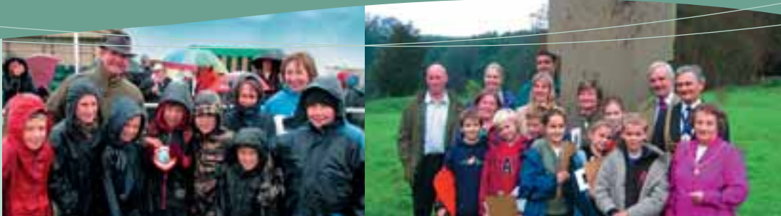
At the County Show. The launch of Discover Gatton