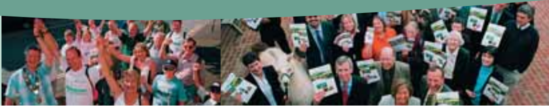
Walkers taking part in The Journey, a walk across the Surrey Hills. The Launch of the Welcome Pack and Explore Leaflet