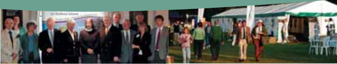
Hindhead Together Meeting. Surrey Hills exhibiting at Country Fair, Loseley Park