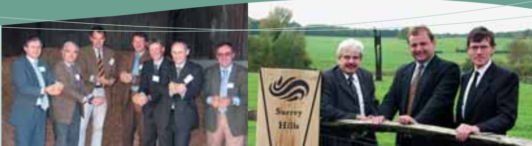
Supporting Surrey Hills Wood Fuel and with Lord Whitby and Surrey Quality producers