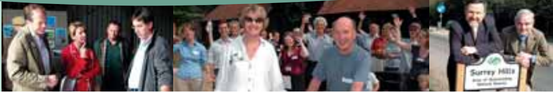
Farm visit: opening of Puttenham camping barn; and with Minister at Hindhead