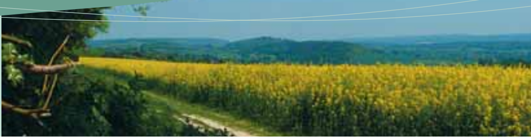
View from The Mount in Guildford by Edina Hasulyo. Highly commended in the 50 Year Anniversary Photo Competition